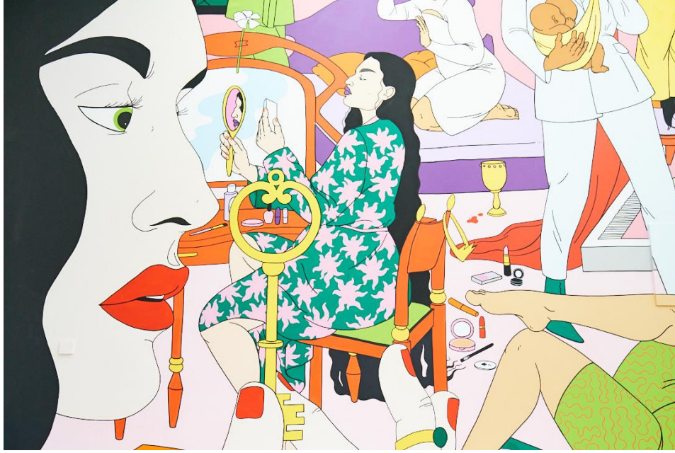
Image: Laura Callaghan, FACT 2019 Mural . Installation view at FACT, Liverpool 2019.