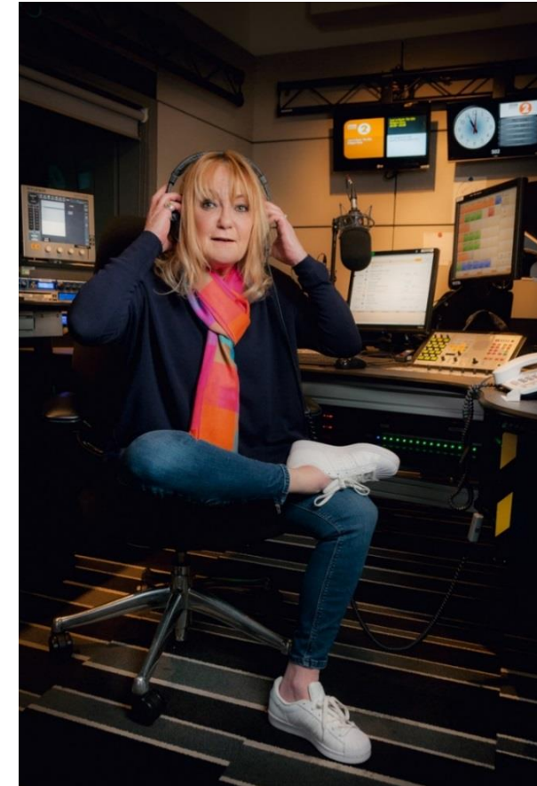
Janice Long – First Woman to present the BBC’s Top of The Pops

In the years leading up to 2018 Anita Corbin shot iconic portraits of 21st century women who have achieved the landmark title “First Woman” across a range of fields. In 2018 Anita launched the First Women travelling exhibition throughout the UK in celebration of 20th and 21st century women, creating a magnificent archive for our daughters and their future children.