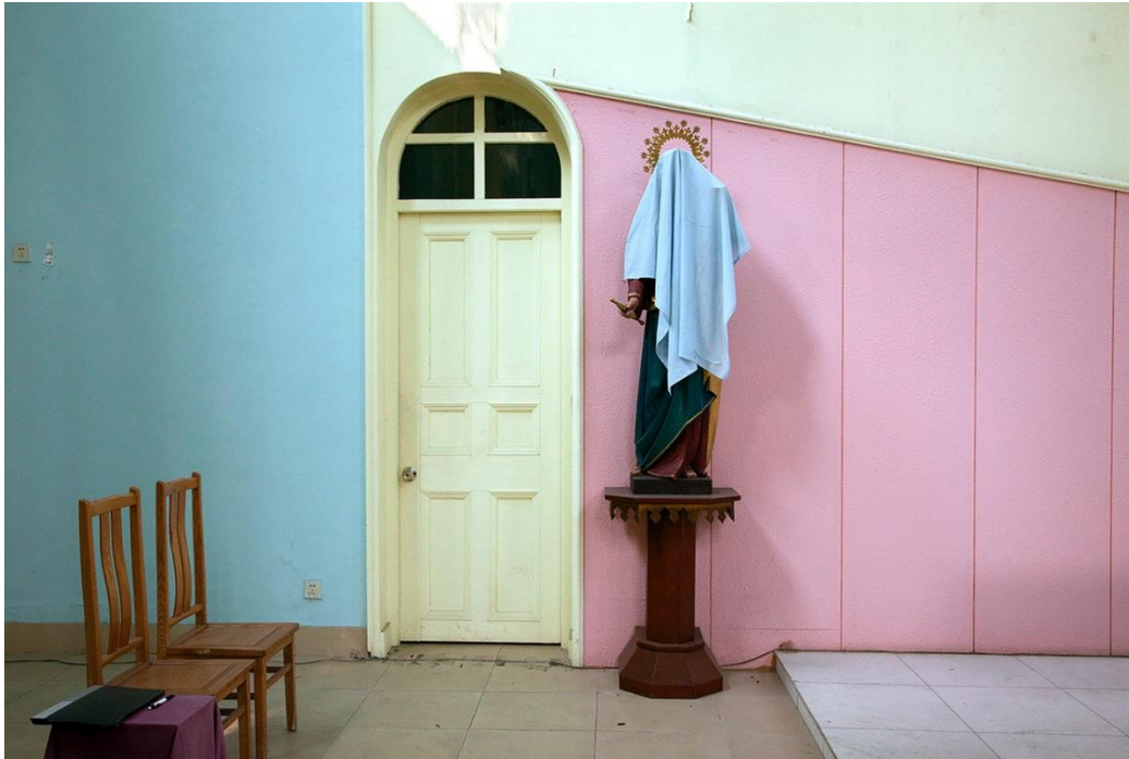
Image: Shesan Seminary Chapel, From the Series 'Shanghai Sacred', C. Liz Hingley, 2013