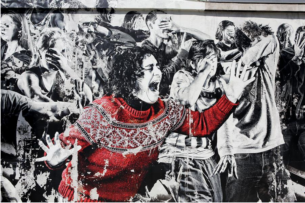
Blind Leading the Blind